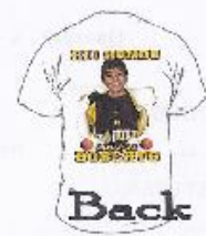
Athlete's individual picture on the back