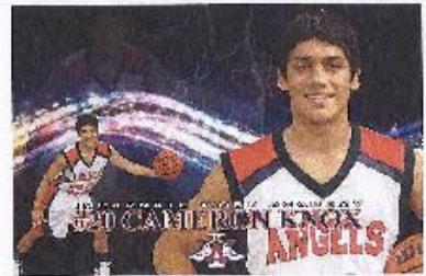
20"x30" Wall Poster $30.00