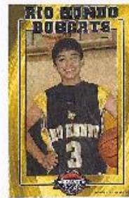
11 x 17 Posters $10.00