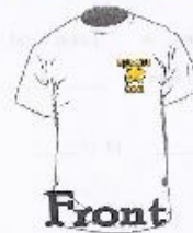
Athlete's picture on the front with their name underneath